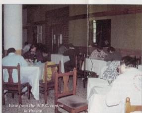
View from the W.P.C. contest in Brasov