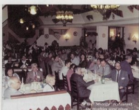
of the "Miorita" restaurant where the trophies were given