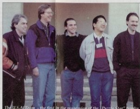
The U.S.A. Team - the first in the possession of the "Puzzle Star" trophy